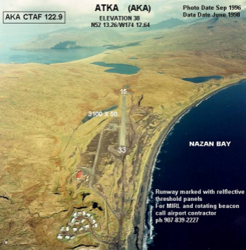
Photo Date Sep 1996 Data Date June 1998